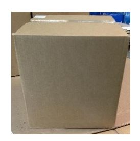
15doz KT Box (KT306)M,L