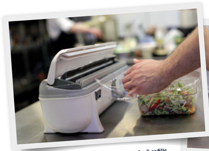
For use with 45cm wide Wrapmaster® refills