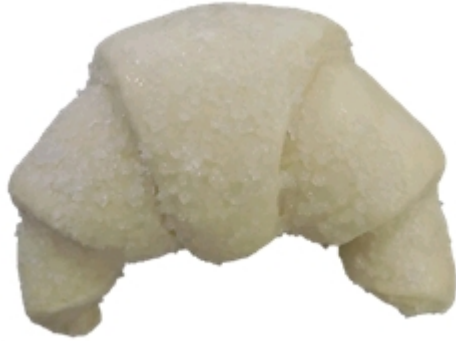
Raw Product Picture