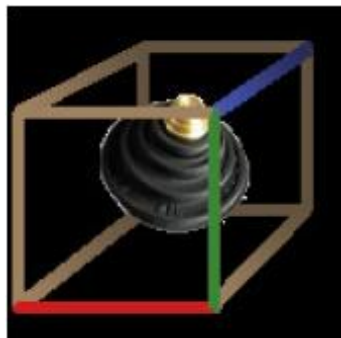
Secondary Packaging Weight And Dimensions